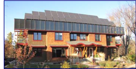
Riverdale NetZero Project

Project: Engineering Analysis, System Modelling Validation, and Monitoring of PV Systems (1988)