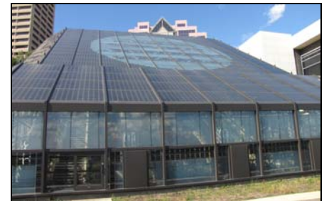
Edmonton Convention Centre