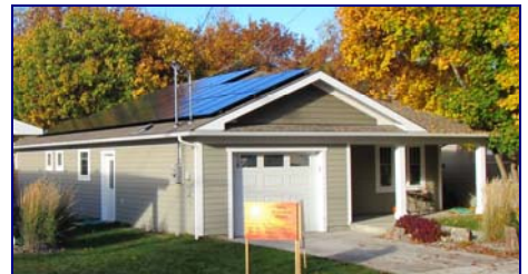
House, Grand Forks, BC