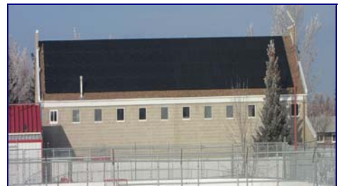
Evansdale Community League