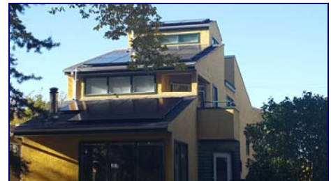
House, Edmonton, AB