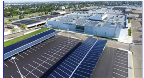
Simons store, Londonderry Mall