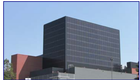
Camrose Performing Arts Centre