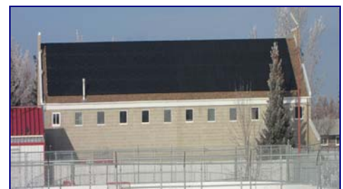
Evansdale Community League