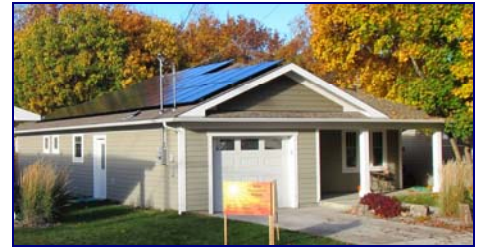
Grand Forks house