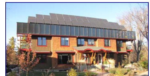
Riverdale NetZero Project

Project: Engineering Analysis, System Modelling Validation, and Monitoring of PV Systems (1988)